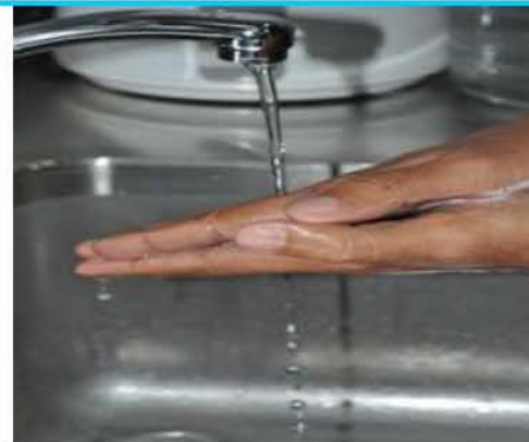
STEP 1 Lather Soap and scrub hands, Palm to Palm