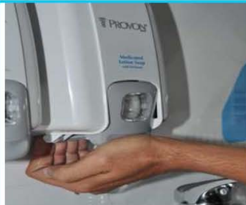
1 or 2 Squirts of liquid or Foam Soap