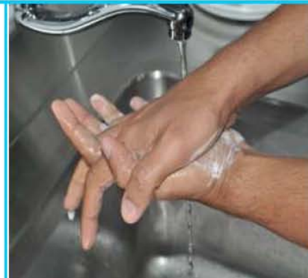
STEP 2 Scrub in Between & around fingers