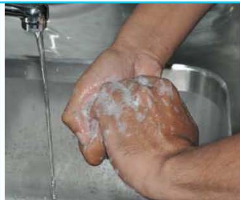
STEP 4 Scrub Finger tips of each hand