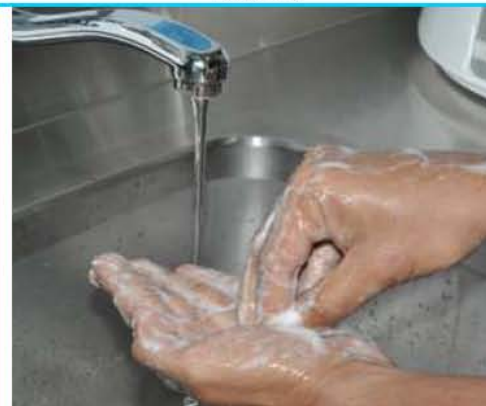
STEP 5 Rotational rubbing with clasped fingers