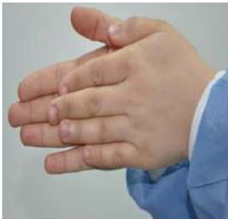
Rub Hands together Palm to Palm