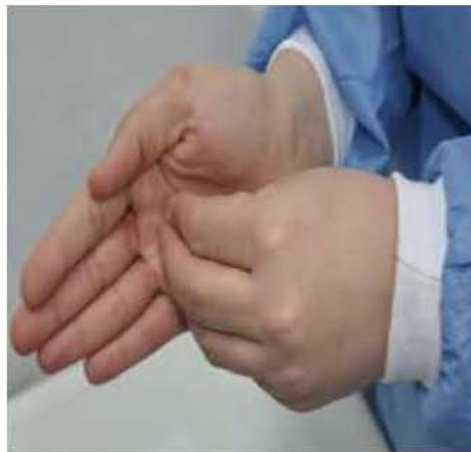
Rub fingertips of each hand in opposite palm