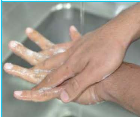
STEP 3 Scrub Back of each hand with opposite palm