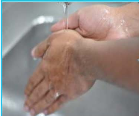
Remove jewellery and wet hands and wrists with warm water