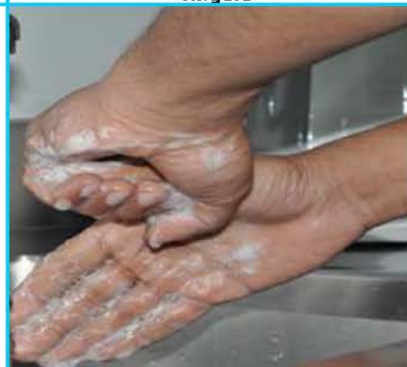
STEP 6 Scrub each thumb clasped in opposite hand