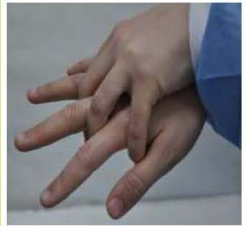
Rub in between and around fingers and cover palm over palm