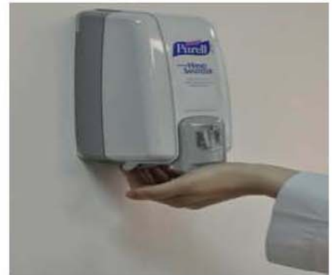
Two squirts of Hand rub Liquid onto Palm