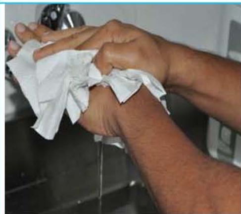
Pat hands dry with paper towel