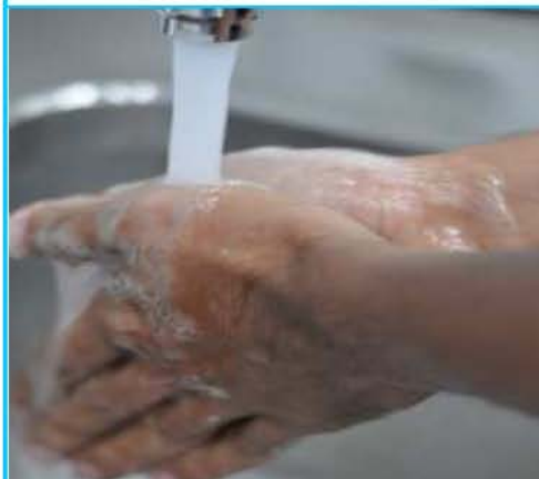
Rinse Thoroughly under running water