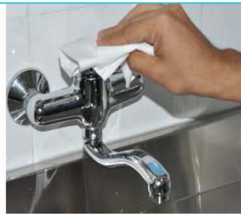
Turn off water faucet using same towel